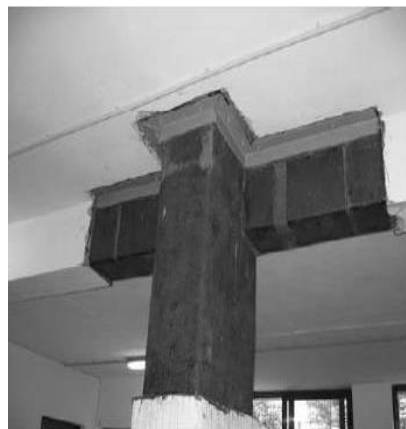
Figure 3. Retrofitting of RC beam-column joints with FRP (Tsonis et al. 2001, Motavalli and Czaderski 2007).