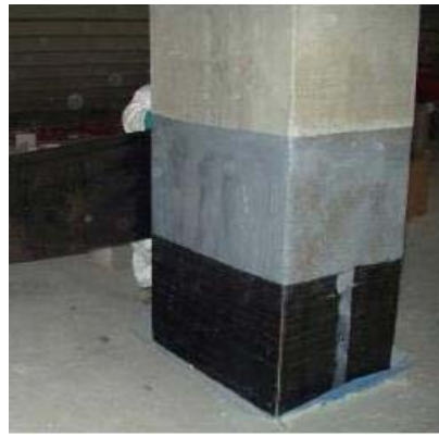
Figure2. Application of FRP for seismic retrofitting of RC columns